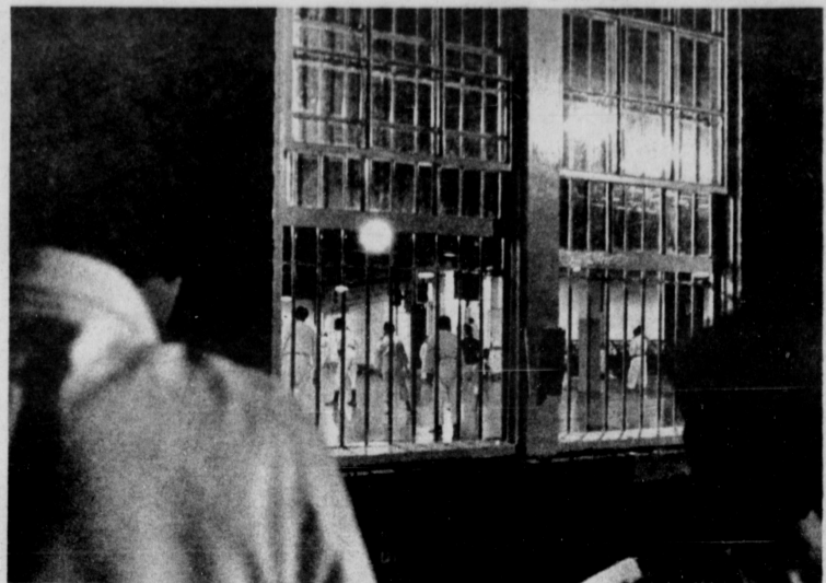
Watching Is Easier