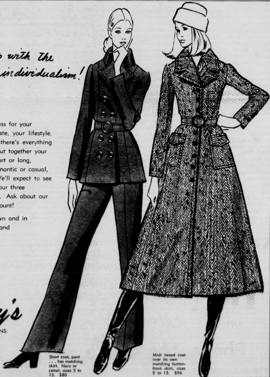
Short coat, pant . . . has matching skirt. Navy or camel, sizes 5 to 13. $80

THREE LOCATIONS: DOWNTOWN SOUTHLAND TURFLAND