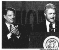
The president's charm may not have rubbed off on Gore, columnist says.

That sort of reasoning is typical for many liberals though. Since they know they