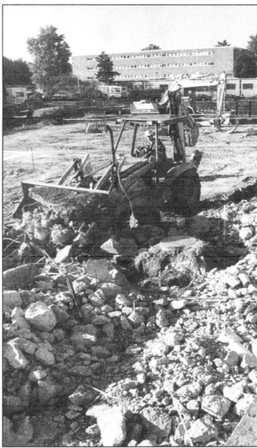
ANY CRAWFORD | KERNEL STAFF

Parkers simply note the number of See PARKING on 2