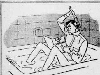
"Turn up shirt collars before washing them..."

FLEISHMAN'S FLORENZ FLOWER SHOP Flowers For All Occasions 187 W. Main Telephone 1598 Third door west of Lane