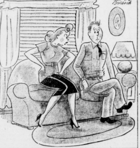
"I'd like to meet that fresh sergeant of yours. I'd tell him what you think of him!"