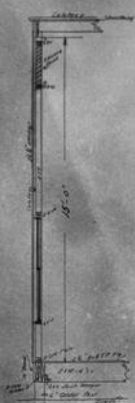
SECTION B-B Scale 1/4" = 1'-0"