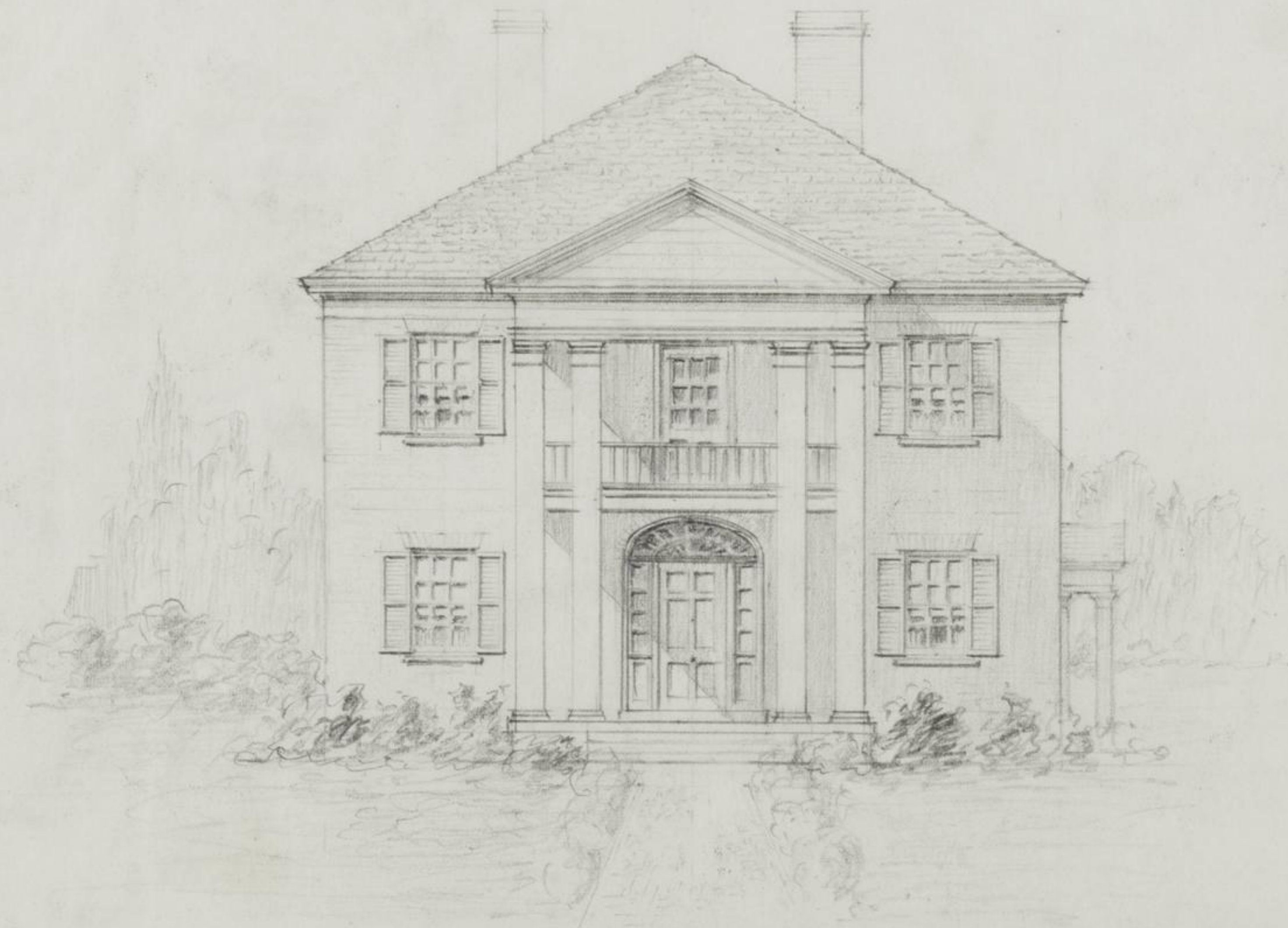
FRONT ELEVATION SCALE 1/8" = 1'-0"

PROPOSED DUPLEX APARTMENT for MRS. CHARLES BASCOM LEXINGTON, KY.