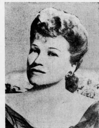
MISS DOROTHY KIRSTEN Metropolitan Soprano