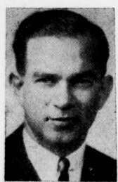
SEN. J. W. FULBRIGHT Lecturer

University of Virginia: "We have never had a class system but year ago, for reunion purposes, the custom was established of electing officers in the spring among the applicants for degrees."