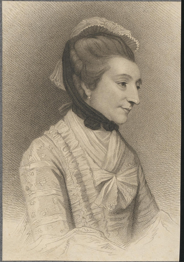
Mrs Elizabeth Montagu.