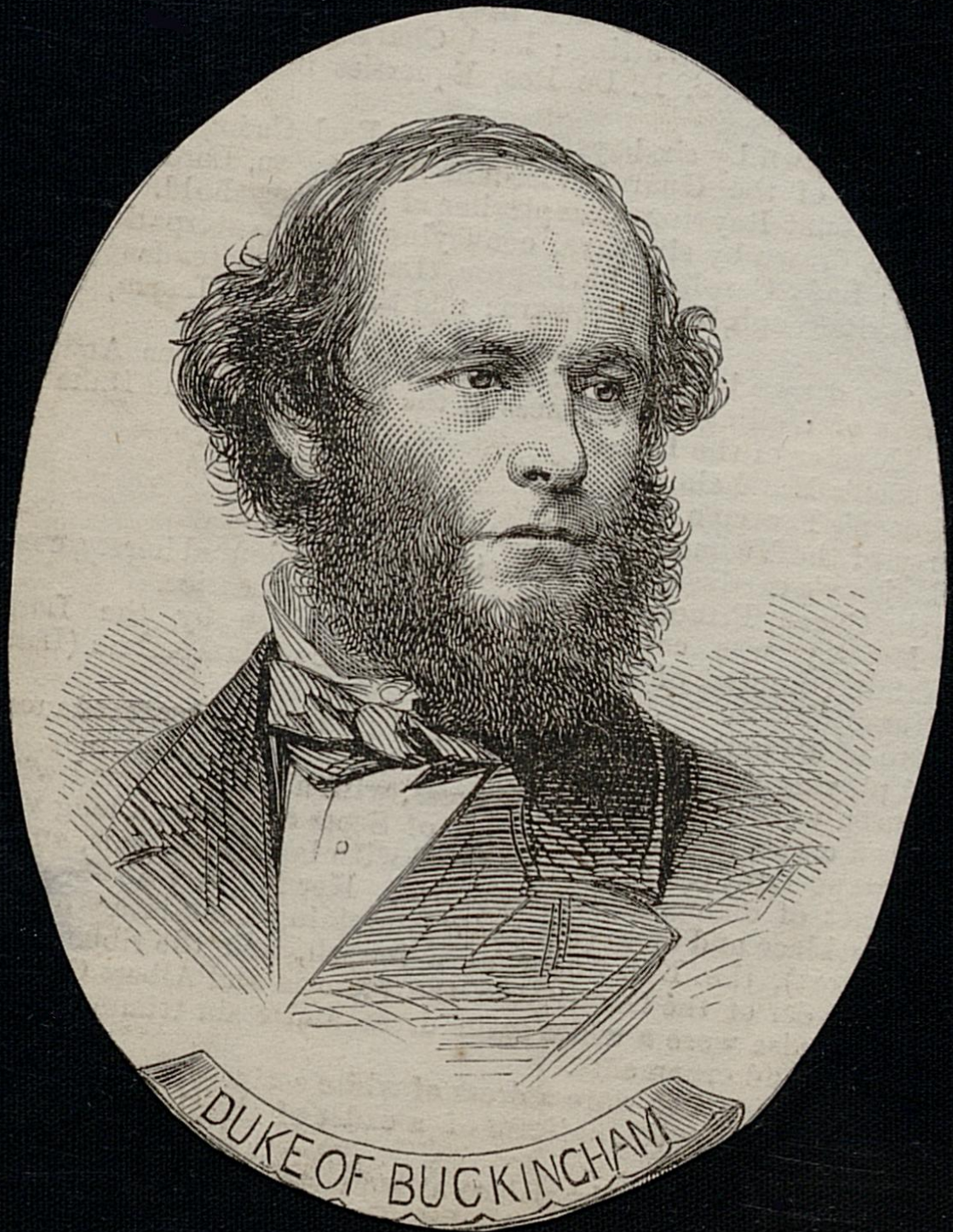
BUCKINGHAM AND CHANDOS, Richard Plantagenet Campbell, Duke of, English statesman, b. 1823, only son of the second Duke of Buckingham; educated at Eton, and Christ Church, Oxford; sat as M.P. for Buckingham, 1846-57; keeper of the privy seal to the Prince of Wales, 1852; chairman of the London and North-Western Railway Company, 1853-61; succeeded to the dukedom, July, 1861; lord president of the council, July 6, 1866, to March 6, 1867; appointed secretary of state for the colonies, March 6, 1867.