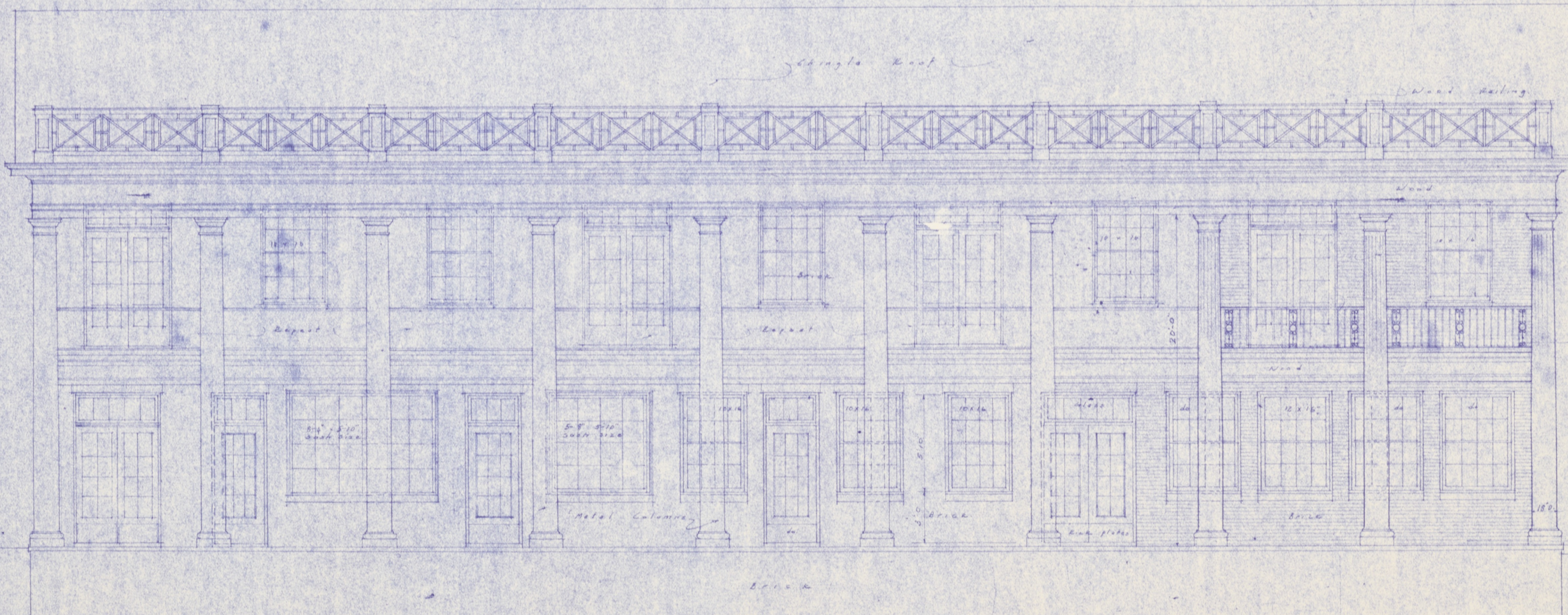
FRONT ELEVATION Scale 1/8" = 1'-0"

Floor construction 2 1/2" Concrete slab on 1/2" Eib Lath. Reinforcing - 1/4" Rods 9" Cts Temp bars - 1" Rods 12" Cts Fin. floor - Quarry tile.