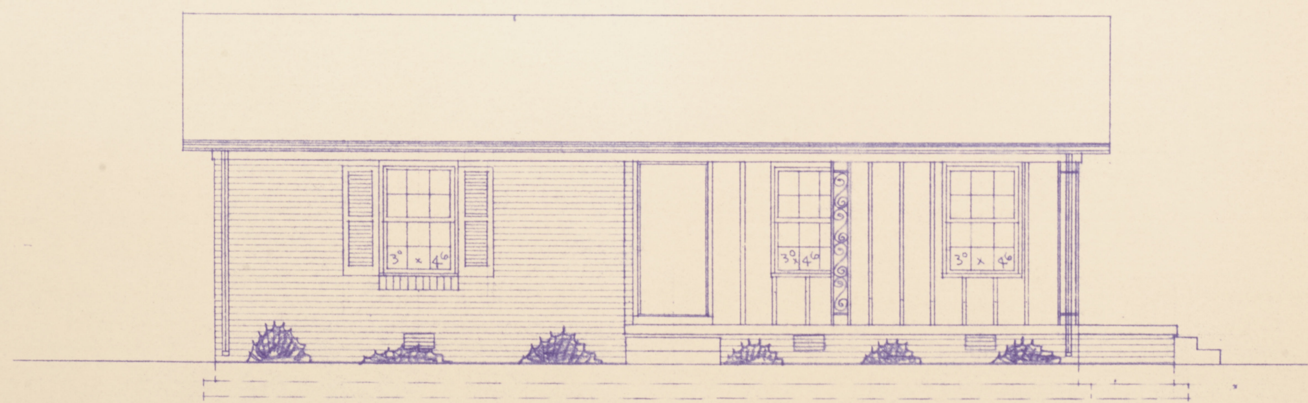
FRONT ELEVATION - "C"

88 MG Wheelwright Collection Blueprints: 196, N.d.