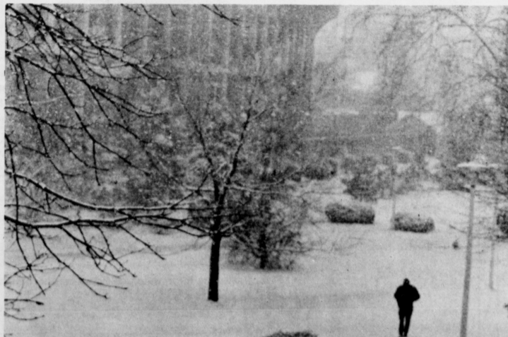
Early morning bleakness provides an unfriendly snow-covered Botanical Gardens on the University campus Saturday.