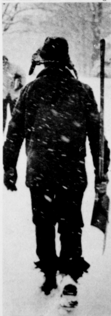
M&O On The Go

The Lexington weather bureau reported that this was the heaviest single snow here since 1947 when 9.5 inches was measured after a 24-hour period. Lexington had another record for the year when the temperature dipped to six degrees below zero at 7:30 a.m. today. The record low was in 1963 when it was 21 degrees below zero. Lexington's five-day forecast calls for temperatures to be 8-14 degrees below the normal 26-43 degree temperatures. Precipitation is expected to be one-half to three-quarters of an inch with occasional light snow.