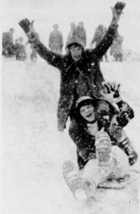
Sliding down a hill on cafeteria trays, UK students frolic in snow that covered the campus over the weekend.