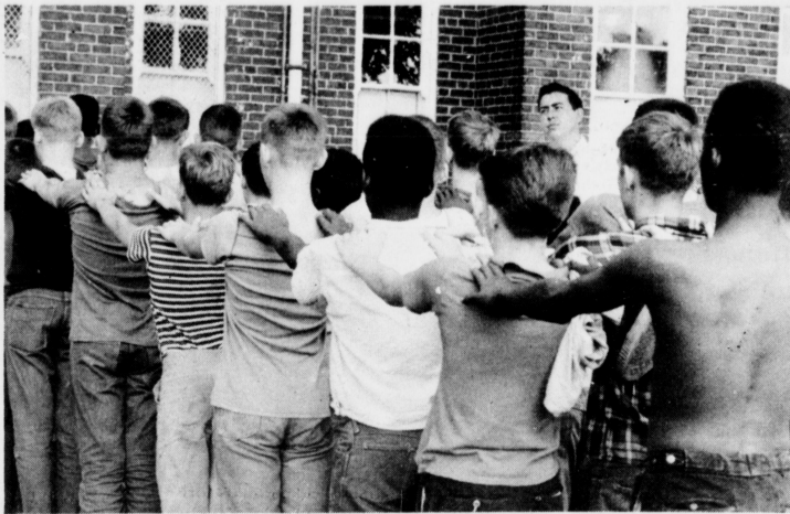
Boys At Kentucky Village Space Off In The Lunch Line