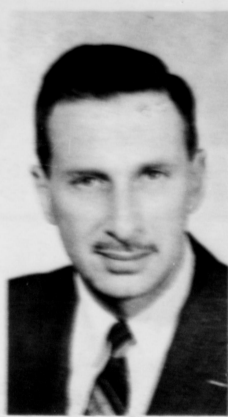
DR. HARRY LEVIN

He has been awarded the American Council of Learned Societies Prize, and honorary