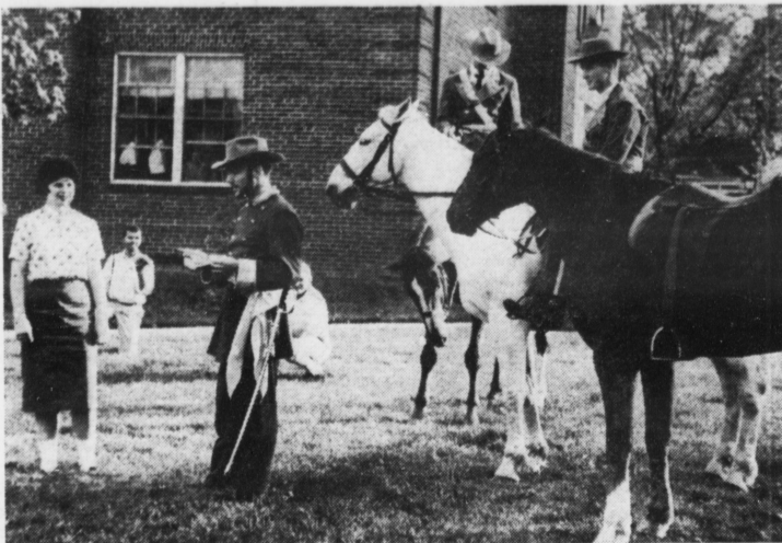
Invitations Southern Style