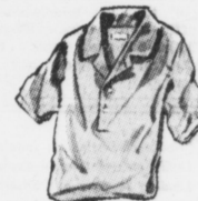
Bermuda Shorts and Short Sleeve Sport Shirts in Various Styles and Colors