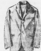
Spring and Summer India Madras Sport Coats . . . $14.95 and up