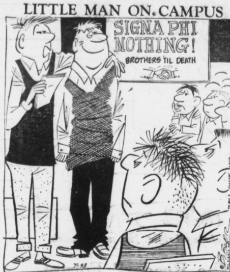
"WITH WINN DRAFTED LETS GIVE BRO HARRY HERE A BREAK AN FIND HIM A PLEDGE-ROOMIE WITH THESE QUALIFICATIONS—SHIRT SIZE 16-35; PANTS 30-34; SHOES 9C; COAT -40—"

"This does not take into account classified cases nor cases which occurred but could not be proven by the rules of American jurisprudence."