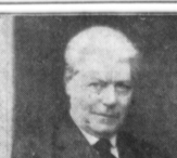
SIR PHILLIP BEN GREET

The Ben Greet players, English organization known throughout the world for its production of Shakespearean plays, will present "Twelfth Night" in the afternoon and "Hamlet" on the night of October 27, in Memorial hall. The presentation will give of Hamlet's is the first quarto version, which was never given in America until last season, when it was presented by the Ben Greet players.