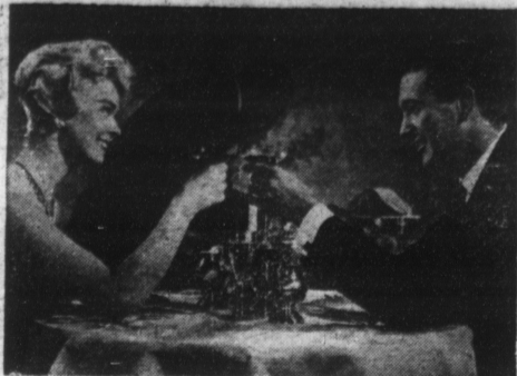
Rock Hudson and Doris Day, rated respectively No. 1 male star, and No. 1 female star in a recent nationwide movie poll, are both in the moving picture, "Pillow Talk," starting tomorrow at the Strand Theater.