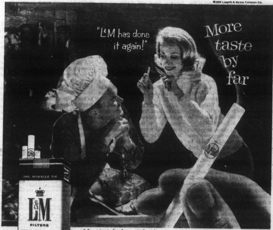
More taste by far...yet low in tar...And they said "It couldn't be done!"

Only the 1960 LM ■ Frees up flavor other filters squeeze in! ■ Checks tars without choking taste! ■ Gives you the full, exciting flavor of the world's finest, naturally mild tobaccos!