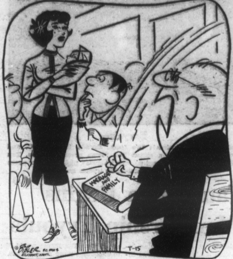
"I THOUGHT I MADE IT CLEAR—THERE IS NO HOMEWORK FOR THIS COURSE."