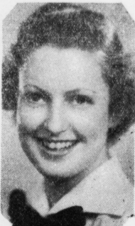
Miss Billie Holliday

SEIBERLING TIRES EXIDE BATTERIES TAYLOR TIRE COMPANY 24-HOUR SERVICE Vine at Southeastern Phone 2030