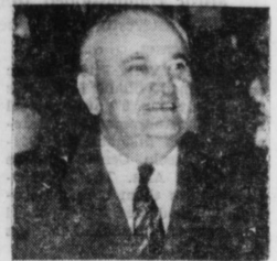
ADOLPH RUPP More Tricky?

Rupp made it plain he is aiming at a much-improved defensive effort—whether it be in the form of the traditional man-for-man or some new arrangement—than turned in by his club at Atlanta. It was in that encounter that the Kentucky chief first employed a zone defense of sorts for the first time ever as he resorted to a half court press in the late stages in an attempt