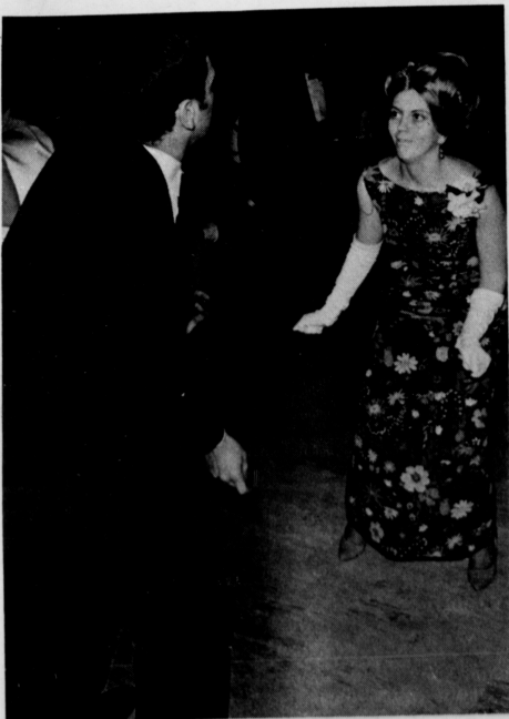
The orchestra provided a wide variety of music. Early estimates indicate about 3,000 persons attended the Ball.