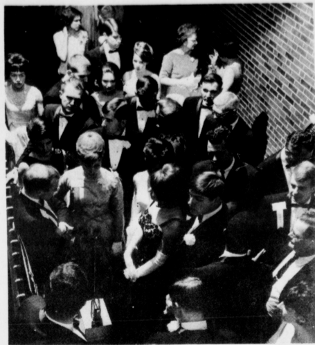
The UK-Mississippi State basketball game provided entertainment for some at the beginning of the Ball.