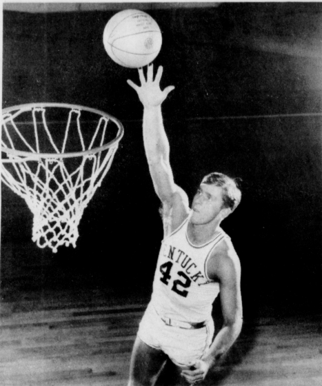
The only Wildcat to be up to form in UK's narrow 73-69 win over Mississippi State University, Pat Riley is the leading scorer on the team and while not scoring, Riley has found time to be the top rebounder also. Just a junior, Riley will be back next year.

"We didn't play a good game, but it's pretty hard to do that here," Rupp said.