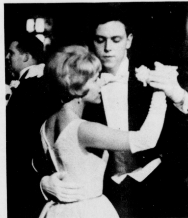
A couple dances to the music of Lester Lanin in the Grand Ballroom.