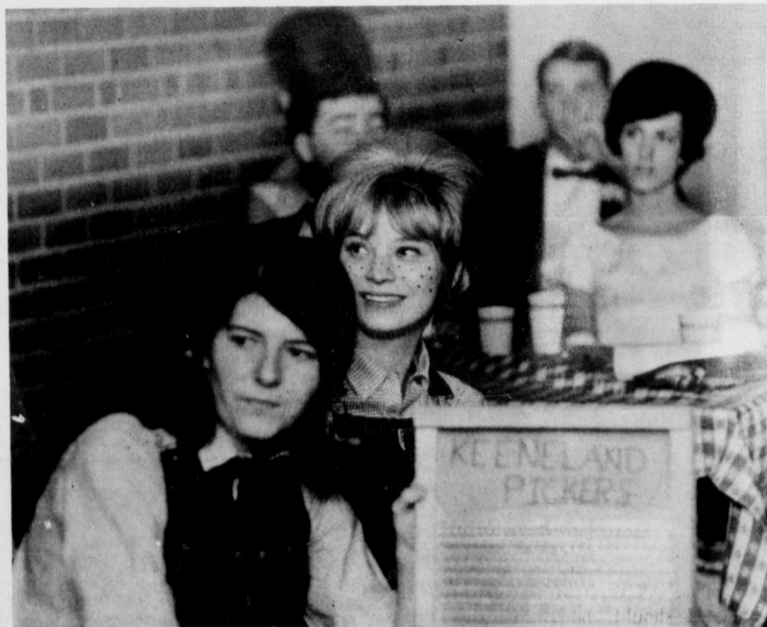
The Keenland Pickers also contributed to the entertainment.