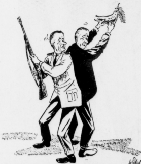
LePelley in The Christian Science Monitor

A victory is impossible because we can not hope to match man-for-man the hordes of North Vietnam and Red China. That is what we have attempted to do thus far: we meet increased Viet Cong forces with increased forces of our own. In short, we are putting ourselves in the position, if indeed we are not already there, from which we will be unable to withdraw with honor.