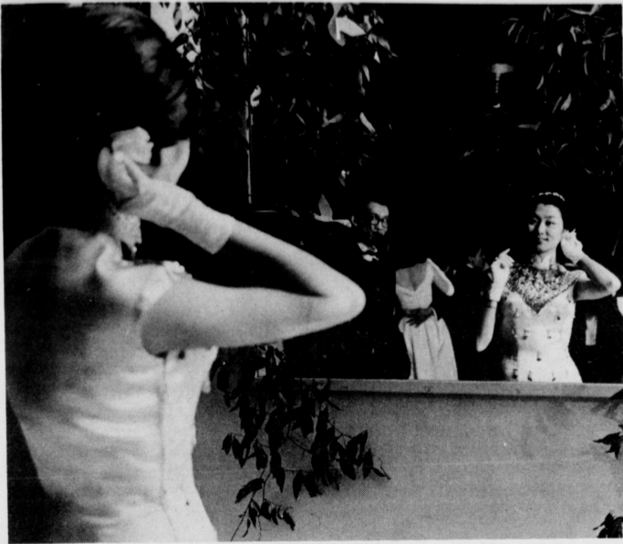
A University coed utilizes a decorated mirror in the Grand Ballroom.