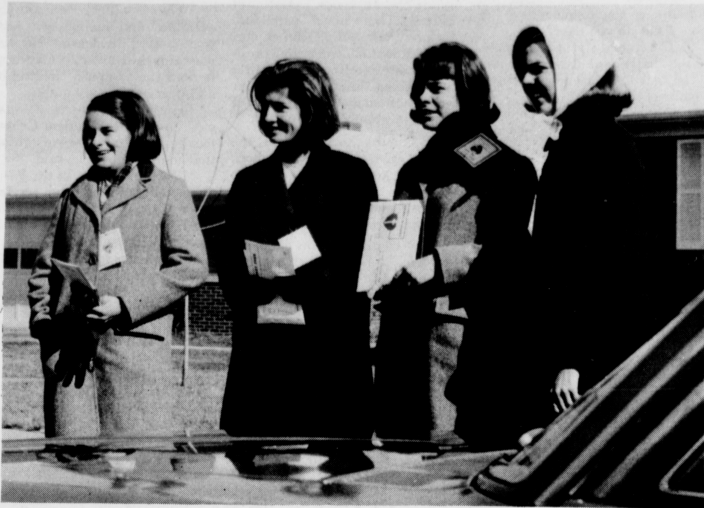
Greeks Go Out For The Heart Fund

At the luncheon, Ambassador Goldberg will make no speech, the centennial office said. The UK Centennial Volume On Higher Education will be officially presented there.