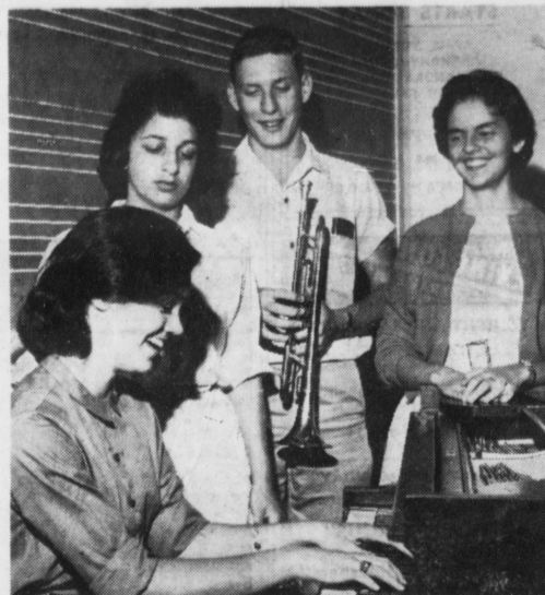
Music Institute Participants

The standings fluctuate from year to year, he said.