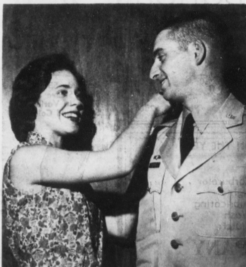
Congratulations . . . Sir

The funeral was Wednesday at Cave Hill Cemetery in Louisville.