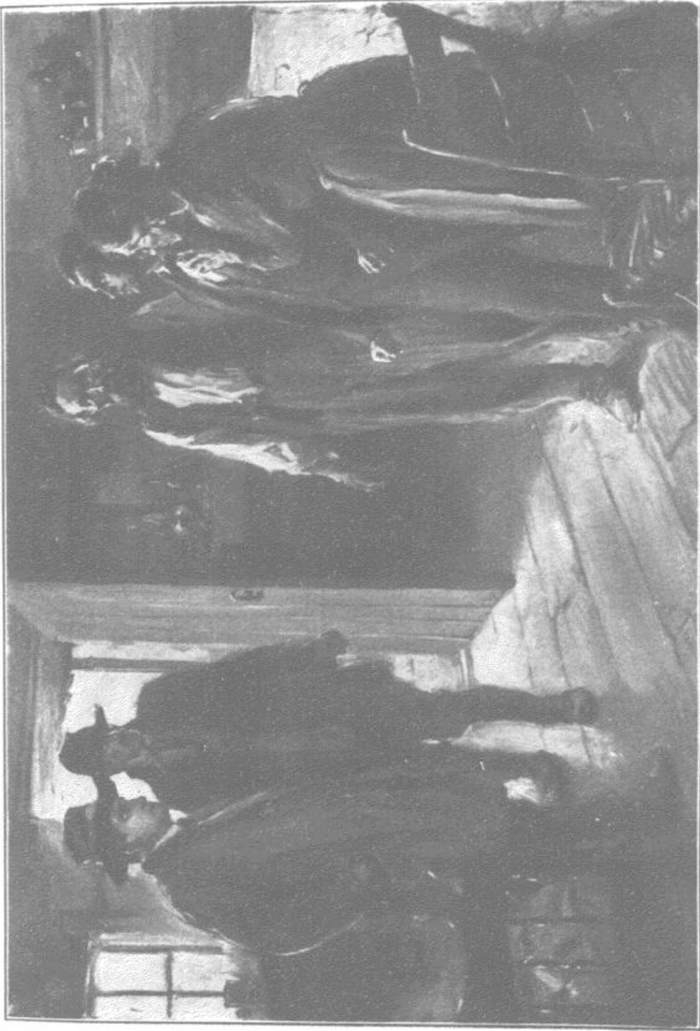
“You hain’t goin’ to give the boy up, Jason?”