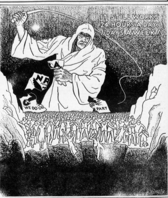
Last Year Tuberculosis Took 2,245 Lives in Kentucky