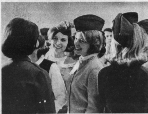
The Kentucky Kernel

If the council is to be active again the idea must come from the students rather than the counselors of the individual groups.