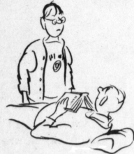
3. You give a gift every week?

We've known each other three full weeks.