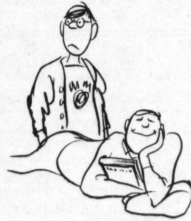
4. Isn't that overdoing it a bit?