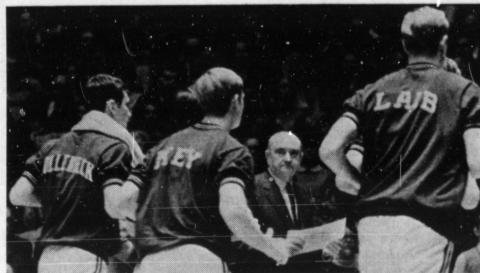
On The Lookout