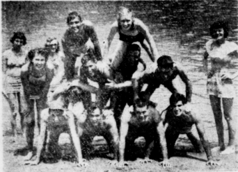
Fun time appears in full swing among University students as groups such as this one gather on the beaches to frolic and obtain that dark brown look that is a mark of social success.