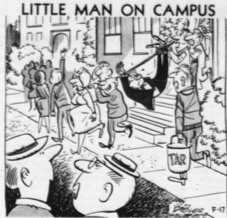
SOMETIMES IN THE SPRING THE STUDENTS ARE VERY APT TO TAKE ISSUE WITH SOMETHING AN INSTRUCTOR WILL SAY.

In fact, however, there is no evidence at all of that. But the mere suspicion of Latin politicians that the threat exists lessens their willingness to create the permanent peace force deeply desired by the U.S.