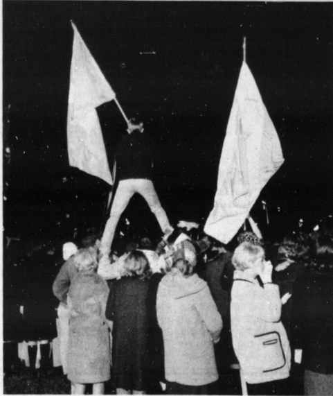
Pep Rally Held