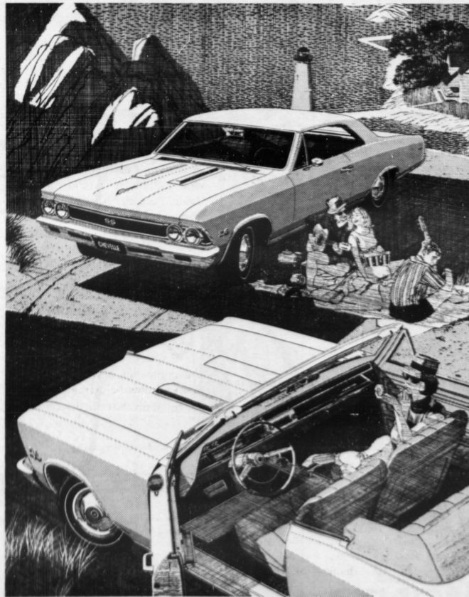
New '66 Chevelle SS 396 Convertible and Sport Coupe.

Equipped with a Turbo-Jet 396 V8, special suspension and red stripe tires.