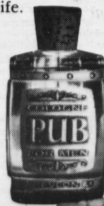
Pub cologne, after-shave, and cologne spray. $3.75 to $10.00. Created for men by Revlon.

Uncork a flask of Pub Cologne. If you hear tankards clash and songs turn bawdy, if the torches flare and the innkeeper locks up his daughter for the night... it's because you've been into the Pub and unloosed the lusty life.