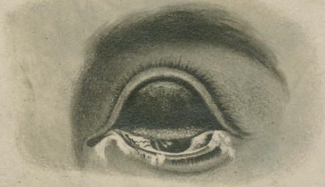
FIG. 2.—TRACHOMA—BEGINNING CICATRIZATION.