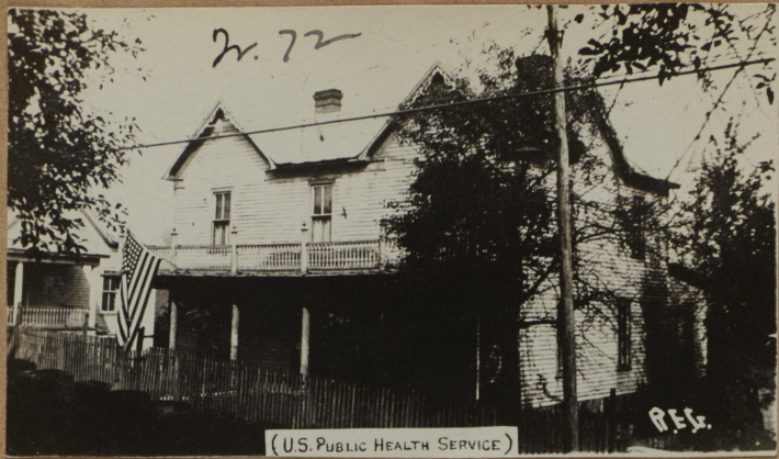
U.S. Public Health Service hospital Jackson, Kentucky.