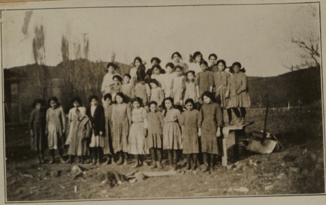
FIG. 16.—WHOLESALE INFECTION WITH TRACHOMA.

Twenty-one out of 31 of these girls are suffering from this disease. Colville Mission School, Wash.