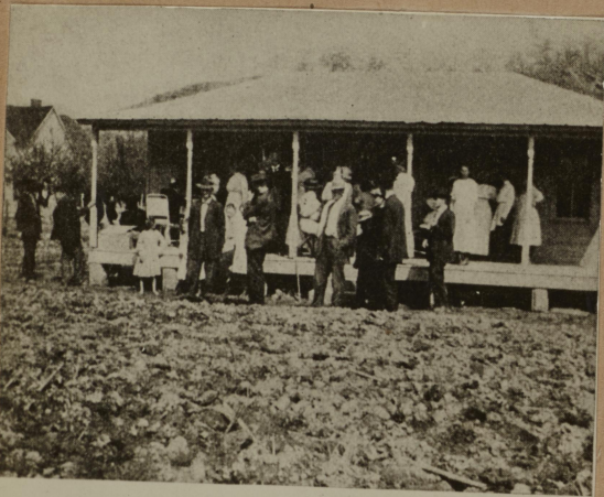
Fig. 1. Trachoma clinic held at Oneida, Ky.