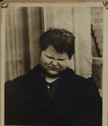
This girl, 18 years of age, states that she has been unable to open her eyes on account of trachoma for about 10 years and at the time this photograph was taken, Dec. 29, 1915, was an inmate of the poor house in Muhlenberg County, Kentucky.