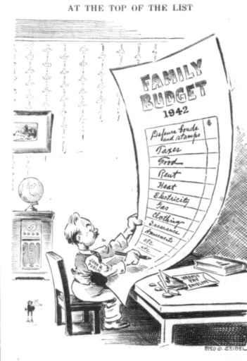
AT THE TOP OF THE LIST

The team is sponsored by W.A.A. and is classified as a major girl's sport on the campus scoreboard and Blade, national honorary senior