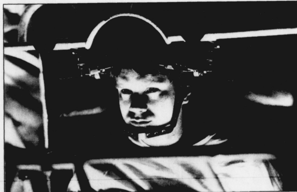
Jacob (Tim Robbins) cannot understand why, or by whom, he is being tormented in 'Jacob's Ladder.'