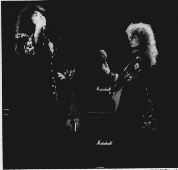
Anne and Nancy Wilson, members of the popular rock band Heart, performed in front of an enthusiastic crowd Wednesday night at Rupp Arena. Opening for Heart was Cheap Trick.